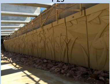
Fish panels on Pikes Peak Greenway Trail