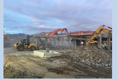
I-25 Bridge Demolition