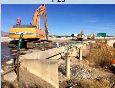
Old Midland Trail Demo under I-25