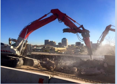
Old Midland Trail Demo under I-25